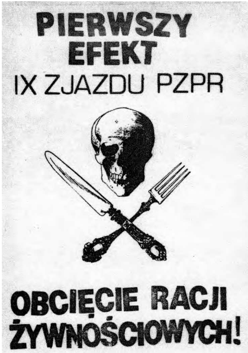
A poster published in Poland in 1981. It says 'The first result of the Ninth Communist Party Congress: a cut in food rations'.