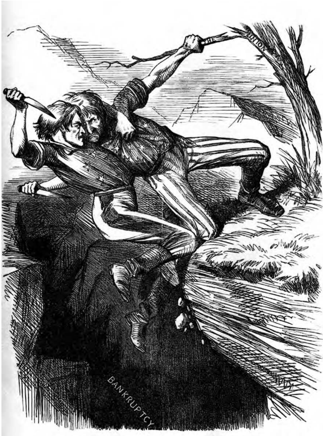
A cartoon from an English magazine, June 1862. The two figures represent the North and the South.