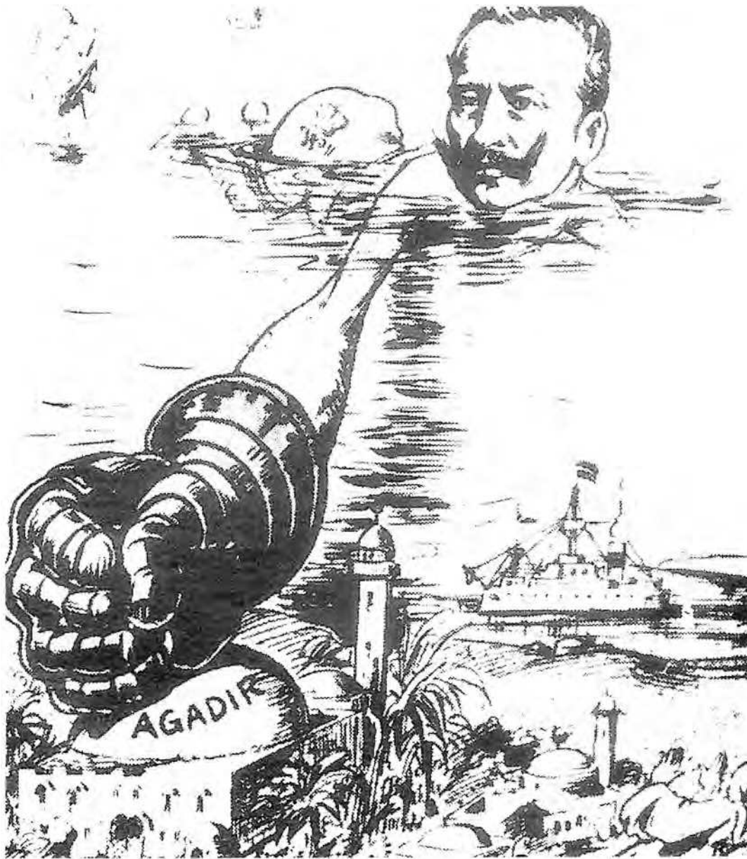
A cartoon about the Agadir crisis, published in 1911.

4 Study the cartoon, and then answer the questions which follow.