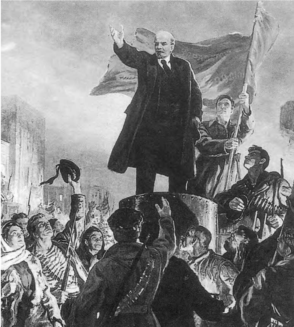
A painting of Lenin addressing a crowd on his return to Petrograd in April 1917.

11 Study the painting, and then answer the questions which follow.