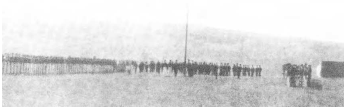
Hoisting the German flag at Angra Pequena, August 1884.

19 Study the photograph, and then answer the questions which follow.