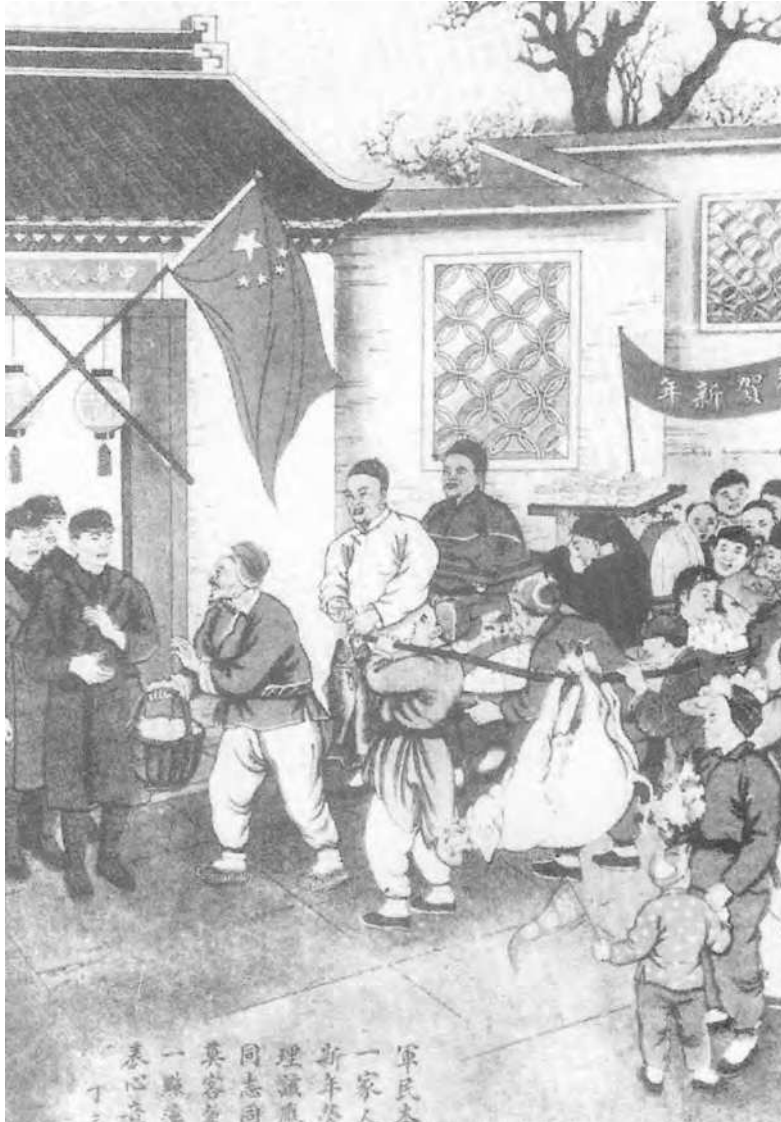
A Chinese poster published in 1950. It is showing happy relations between peasants and the People's Liberation Army.

15 Study the picture, and then answer the questions which follow.