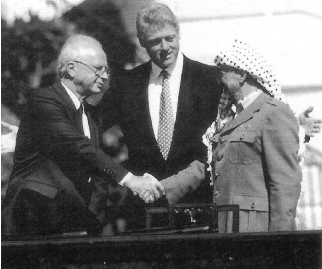
Rabin and Arafat shake hands while US President Clinton looks on, 1993.

20 Study the photograph, and then answer the questions which follow.