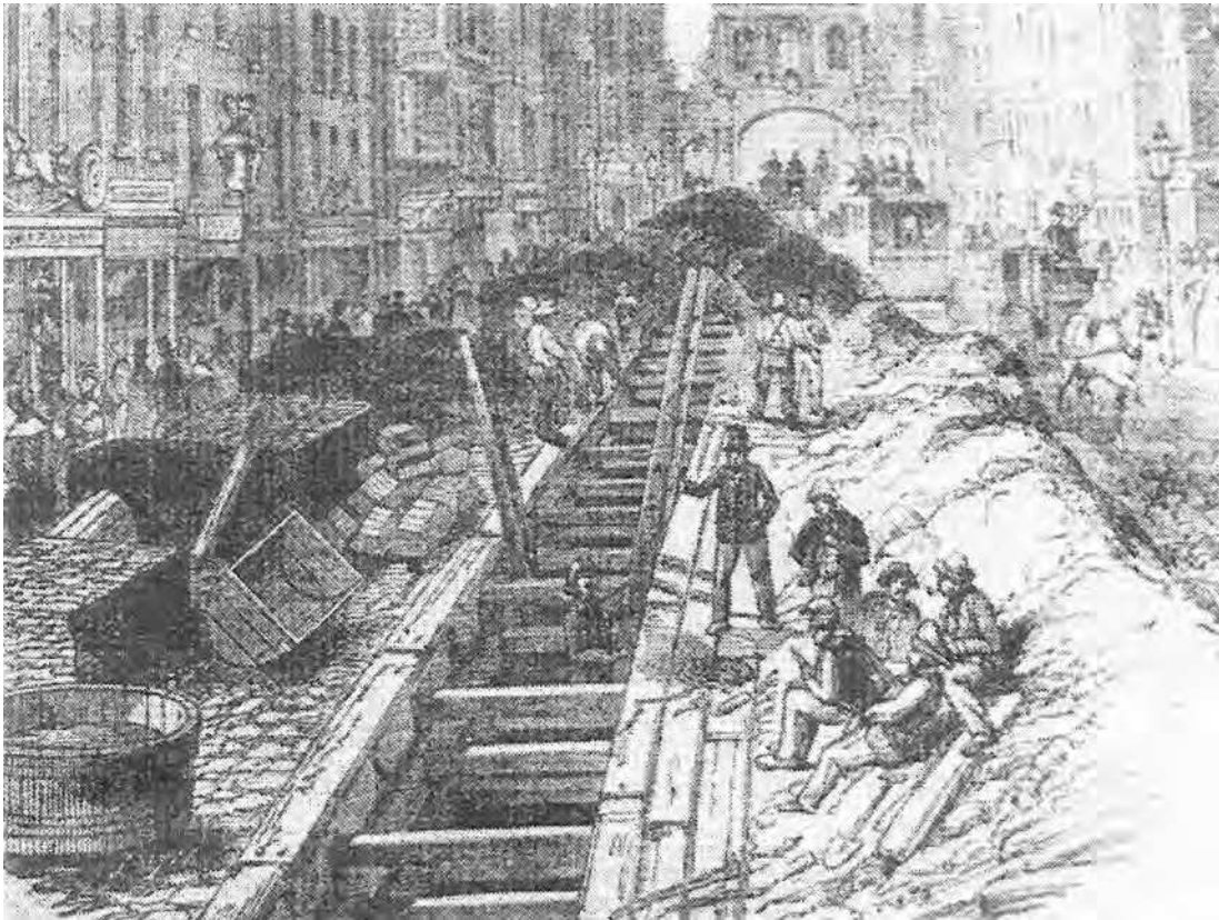
Building a sewer in London in 1844.

23 Study the illustration, and then answer the questions which follow.