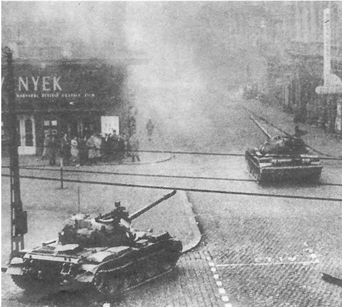
Soviet tanks in the centre of Budapest, November 1956.

8 Study the photograph, and then answer the questions which follow.