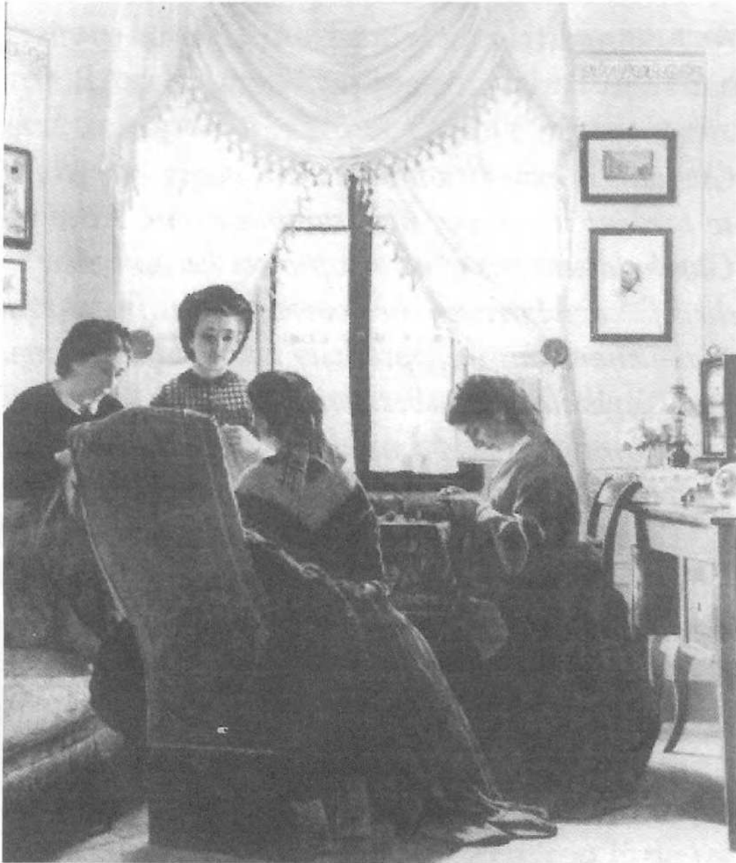
A picture entitled 'The Sewing of Red Shirts' showing women preparing shirts for volunteers in Garibaldi's army.

2 Study the picture, and then answer the questions which follow.