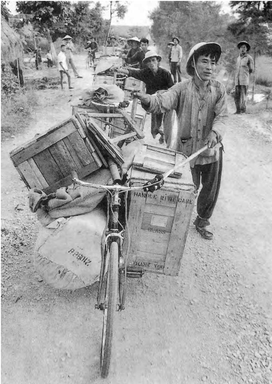
A Vietcong supply convoy.

7 Study the photograph, and then answer the questions which follow.