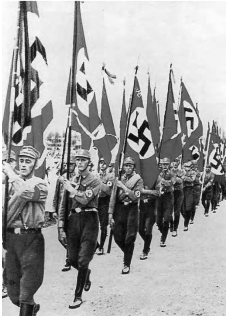
The SA parading at Nuremberg in 1933.