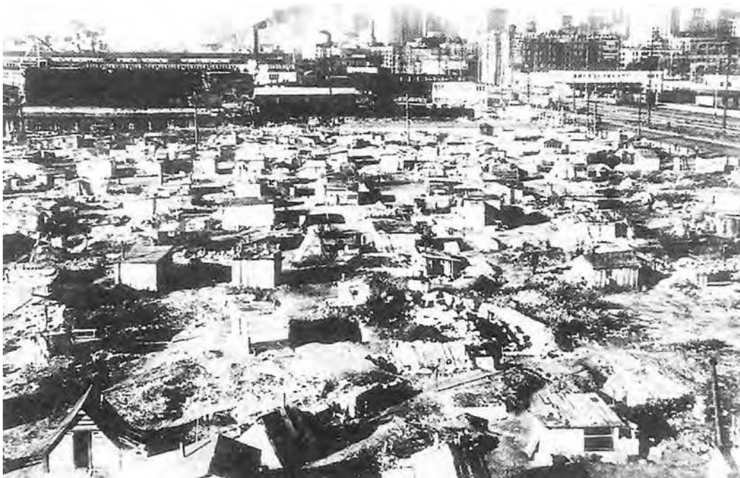
A Hooverville shanty town on wasteland in Seattle, Washington.

14 Study the photograph, and then answer the questions which follow.