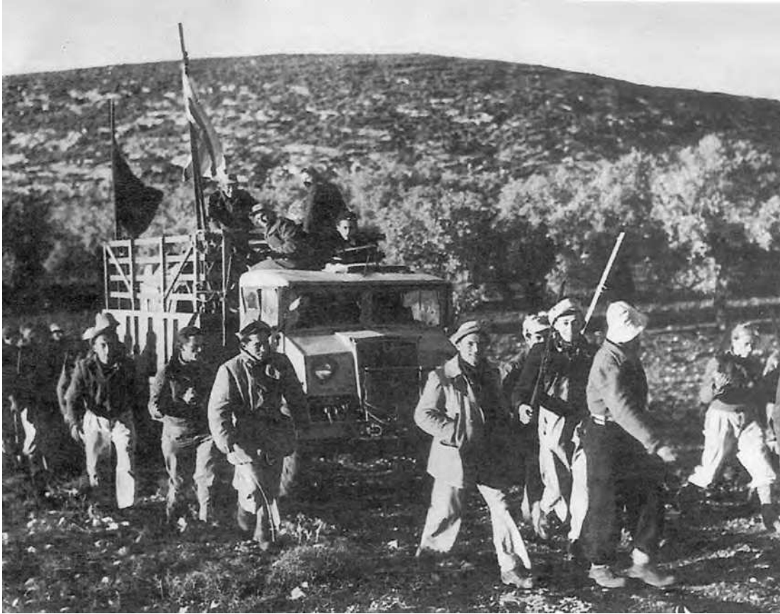
Jewish immigrants arriving in 1949 to build settlements on Palestinian land.

21 Study the photograph, and then answer the questions which follow.