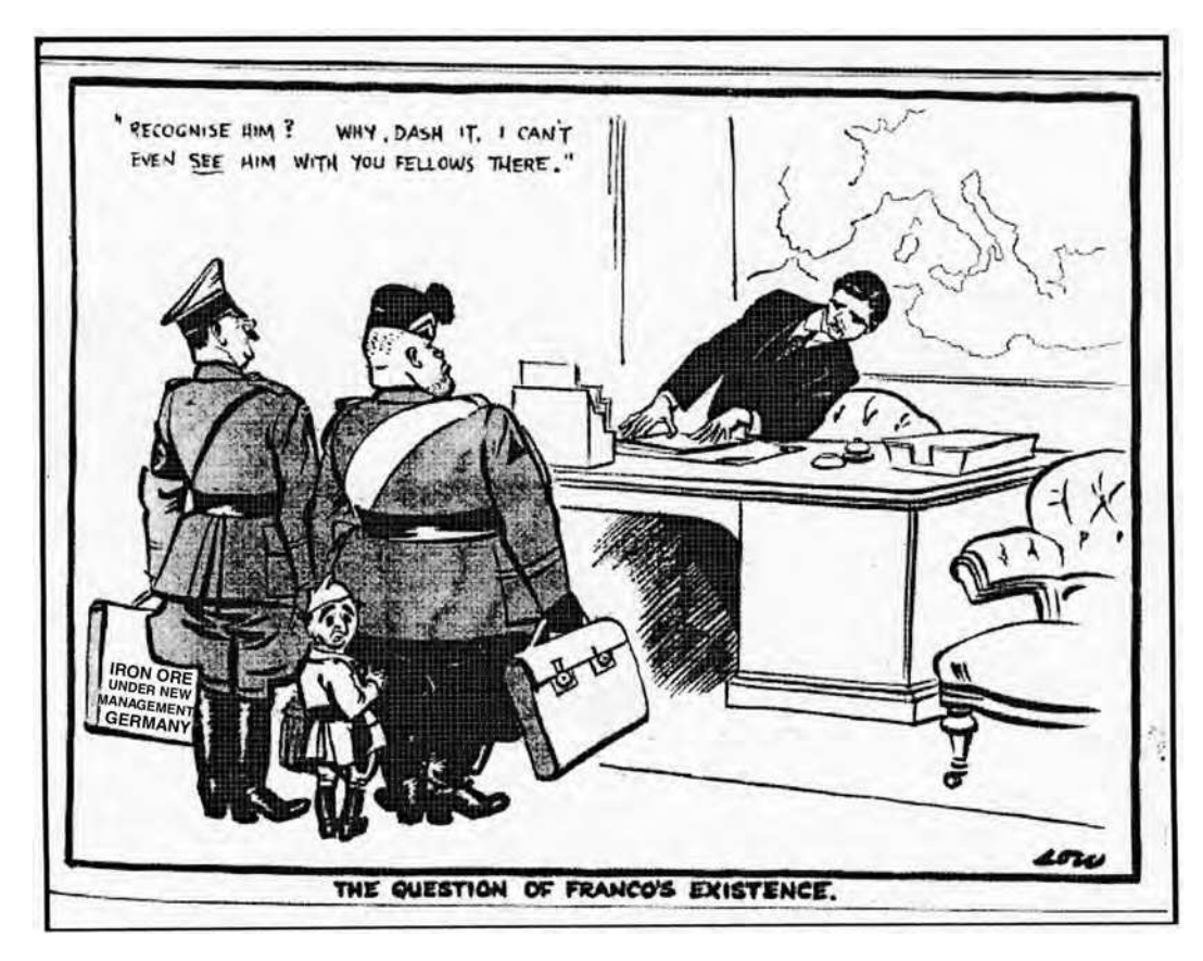
A cartoon published in Britain in July 1937. The figure behind the desk represents the British Government.