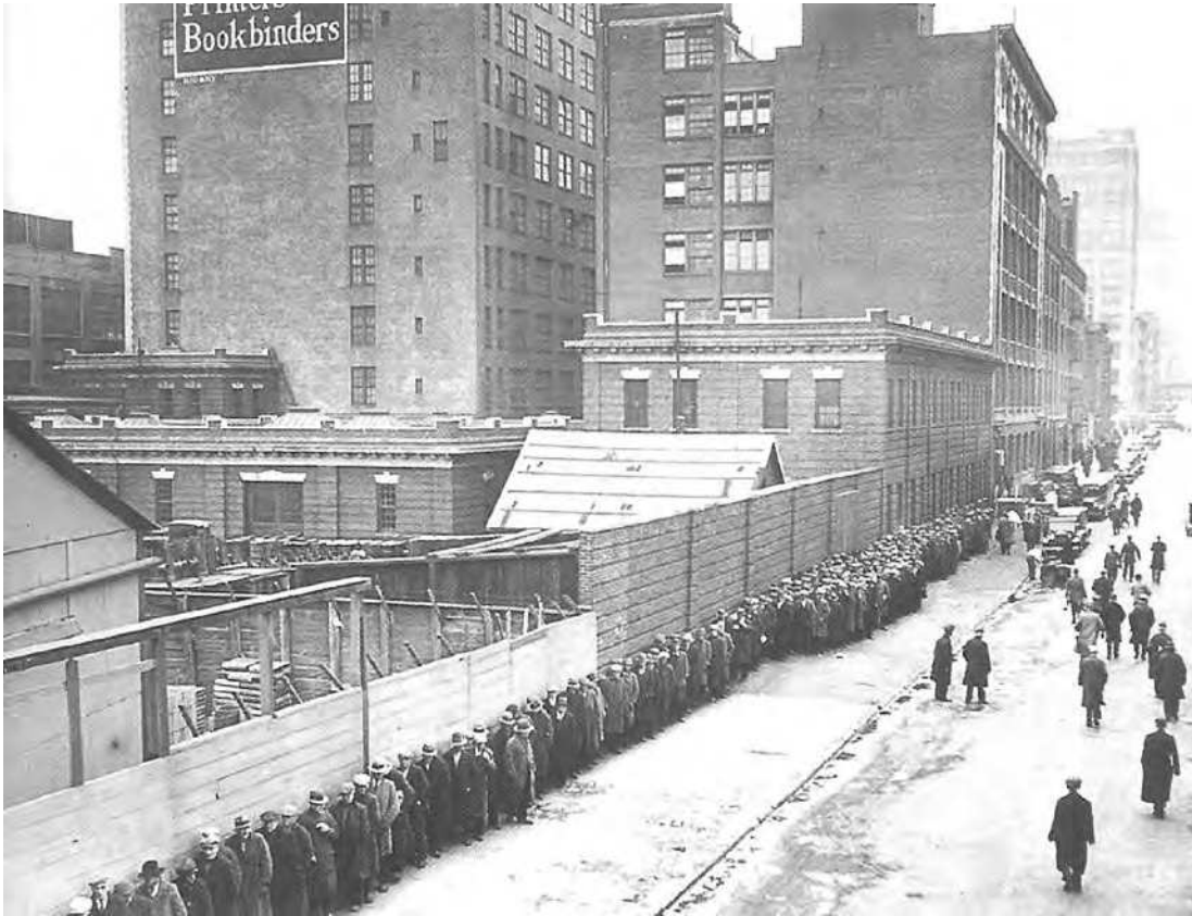
Queuing for a meal in New York, 25 December 1931.

14 Study the photograph, and then answer the questions which follow.