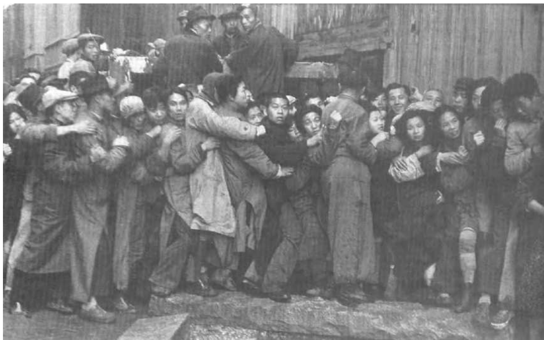
Desperate savers outside a Shanghai bank in 1948, queuing to exchange their paper money for gold before inflation makes it worthless.

15 Study the photograph, and then answer the questions which follow.