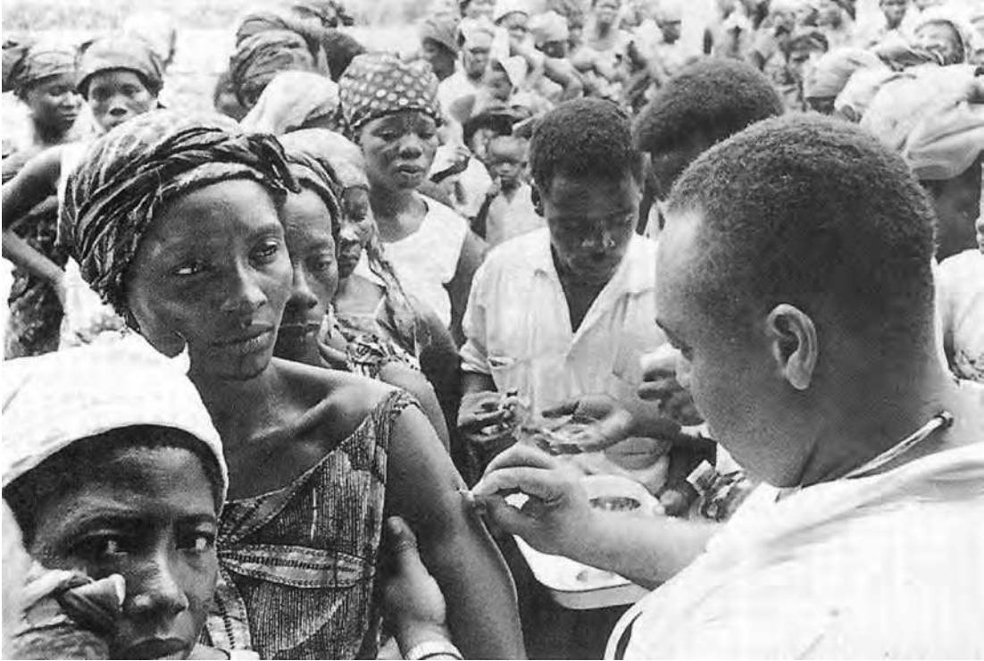
A doctor working for the WHO vaccinating villagers in the Congo to protect them against a smallpox epidemic.

8 Study the photograph, and then answer the questions which follow.