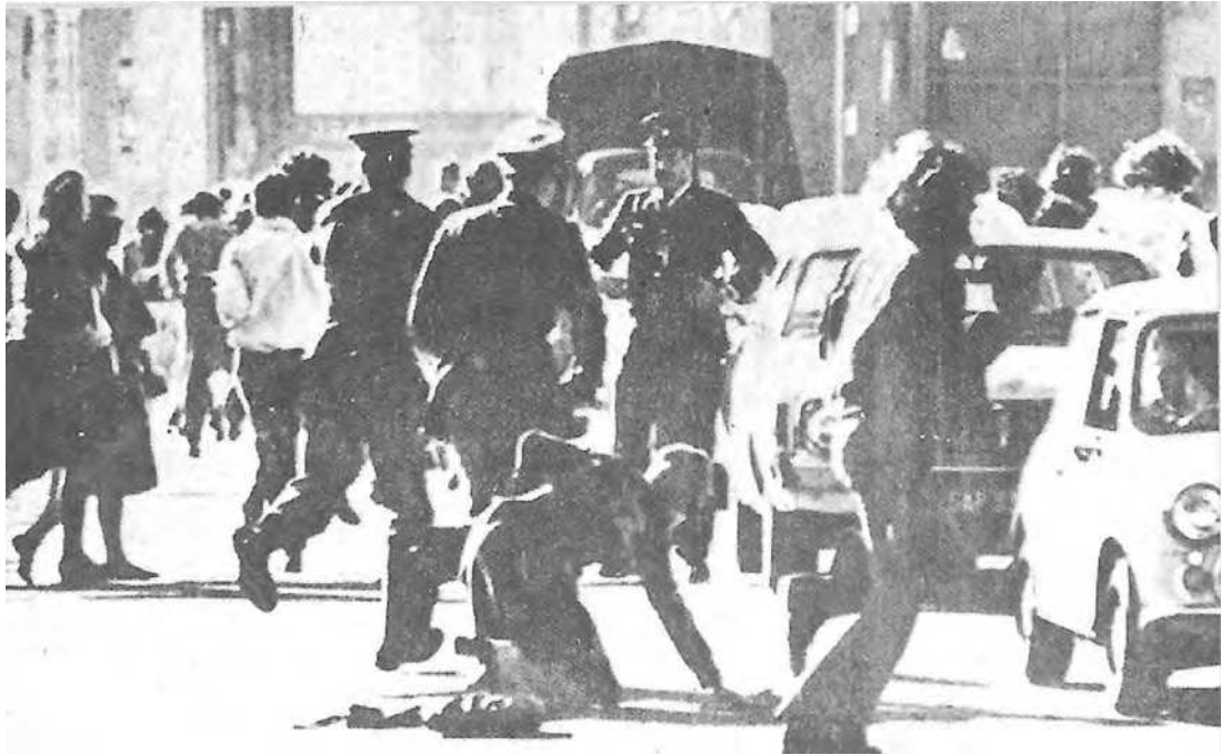
A photograph from the Cape Times, 18 June 1976. It shows people demonstrating at the South African Embassy in London.

18 Study the photograph, and then answer the questions which follow.