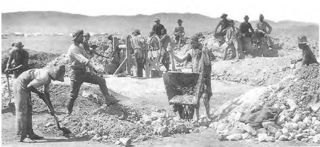
Gold mining at 'the Rand', 1888.

17 Study the photograph, and then answer the questions which follow.