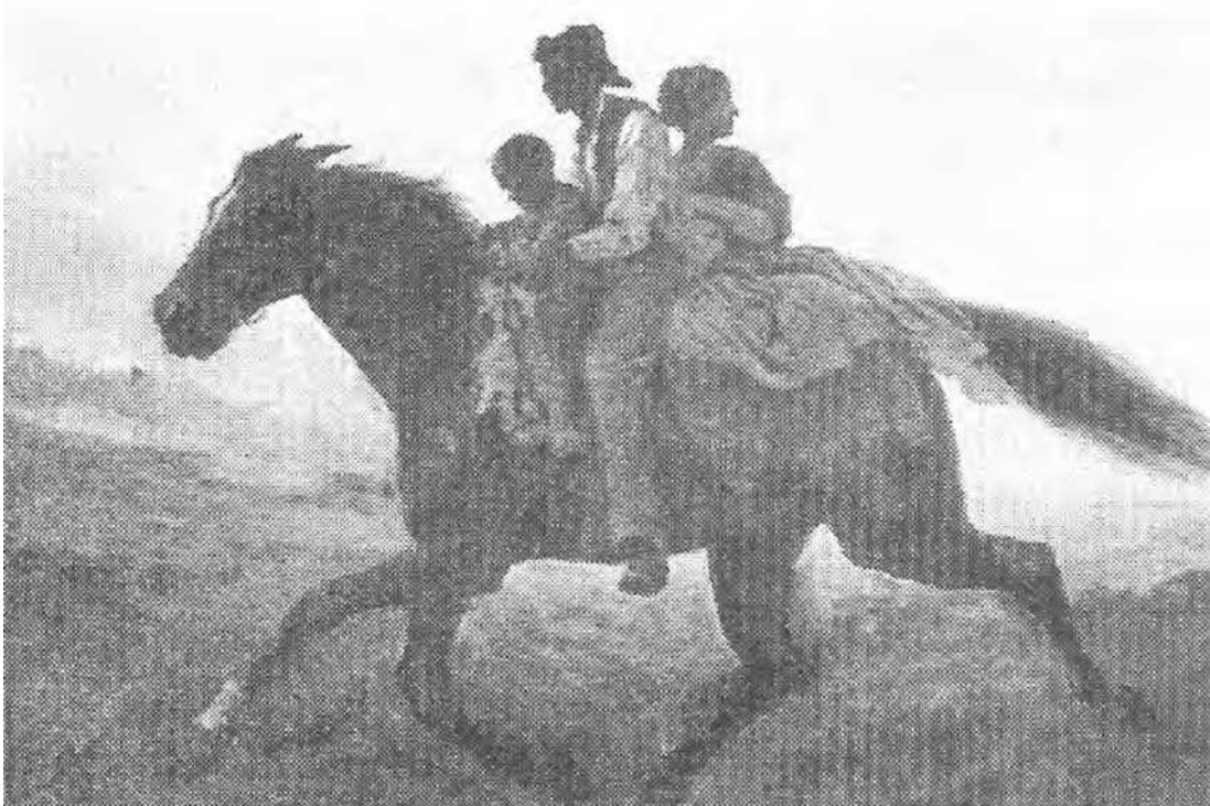
'A Ride for Liberty: The Fugitive Slaves.' An American painting, 1860.