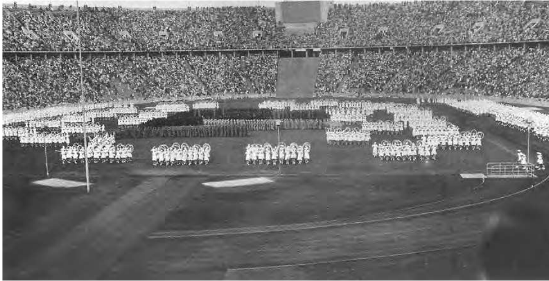
The opening ceremony of the 1936 Olympic Games in Berlin.

10 Study the photograph, and then answer the questions which follows.