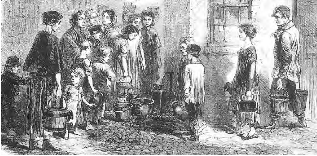
An engraving from 1862 showing a queue for water.

22 Study the illustration, and answer the questions which follow.