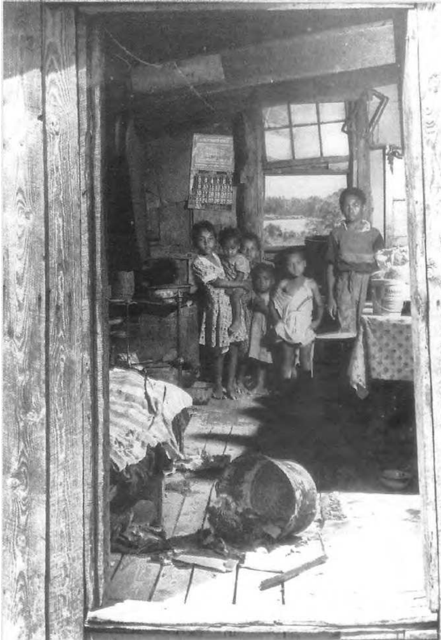
A family home in the Southern state of Virginia.

13 Study the illustration, and then answer the questions which follow.