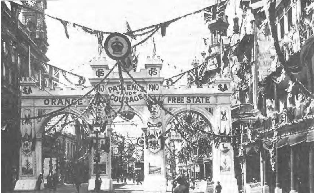
A photograph showing celebrations in South Africa on the creation of the Union, 1910.

17 Study the photograph, and then answer the questions which follow.