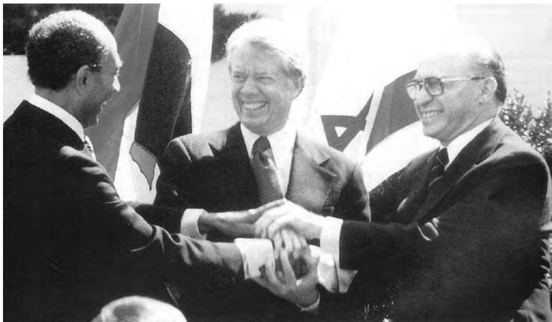
President Carter, President Sadat and Prime Minister Begin after signing a peace treaty in March 1979.

20 Study the photograph, and then answer the questions which follow.