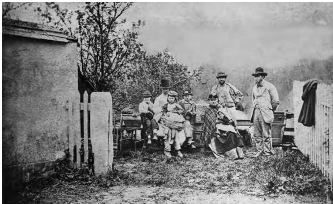
Farm labourers evicted from their home for being members of the National Agricultural Labourers' Union, 1874.

23 Study the picture, and then answer the questions which follow.