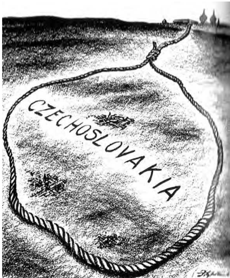
An American cartoon published in 1947. The title of the cartoon is 'When the time is right'.