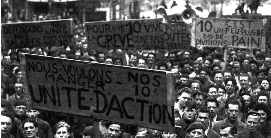
A photograph of workers in Paris demonstrating in 1947 for more pay, more bread and more united action by left-wing groups.