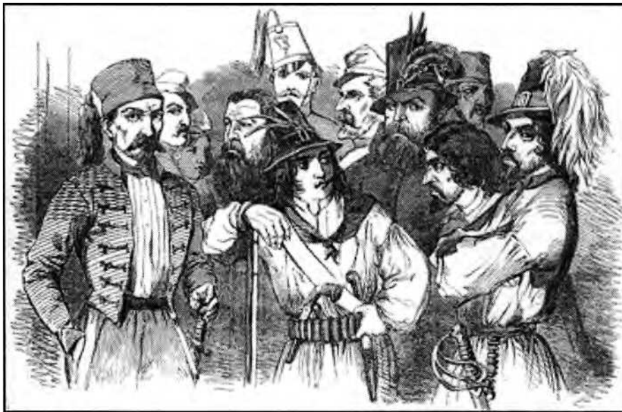
A drawing entitled 'Rome – Garibaldi's Men', published in an English magazine in July 1849.