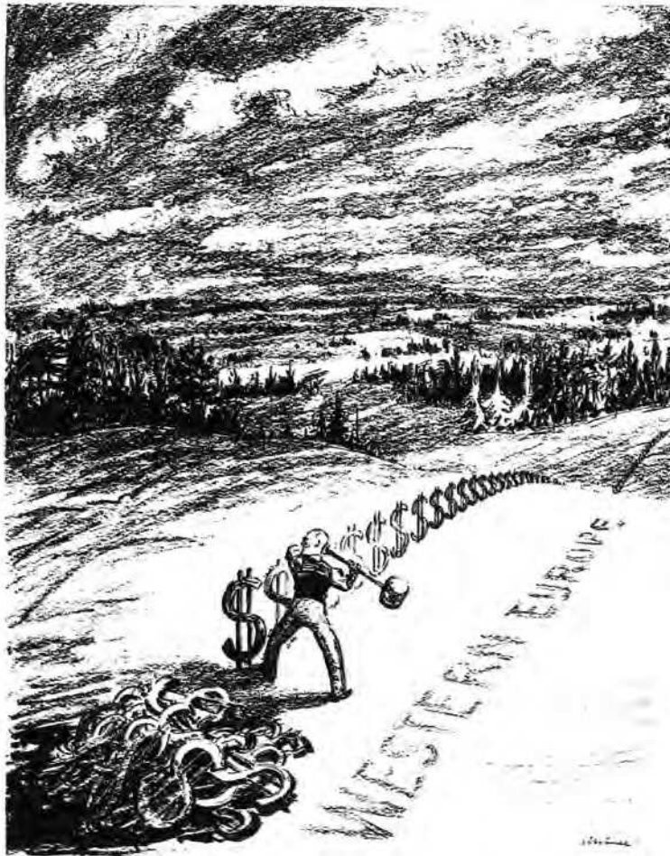
A cartoon published in Britain in 1947. The cartoon is called 'The Truman Line.'