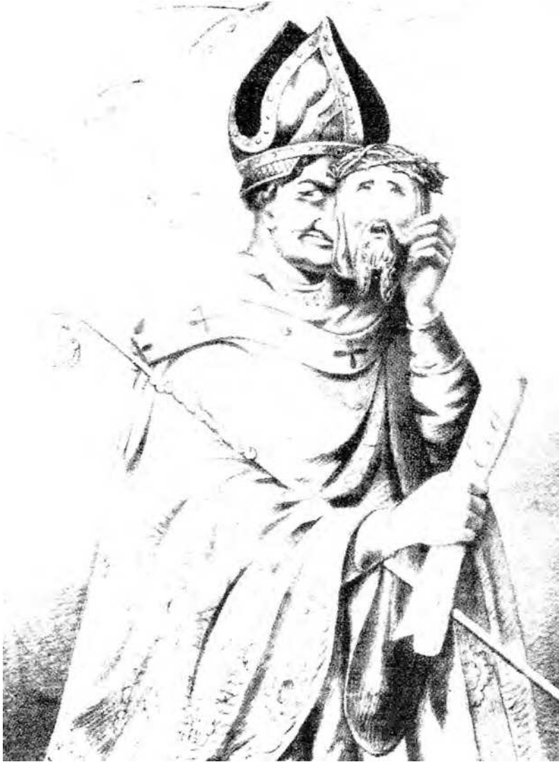
A cartoon of Pope Pius IX, published in Italy in 1852.