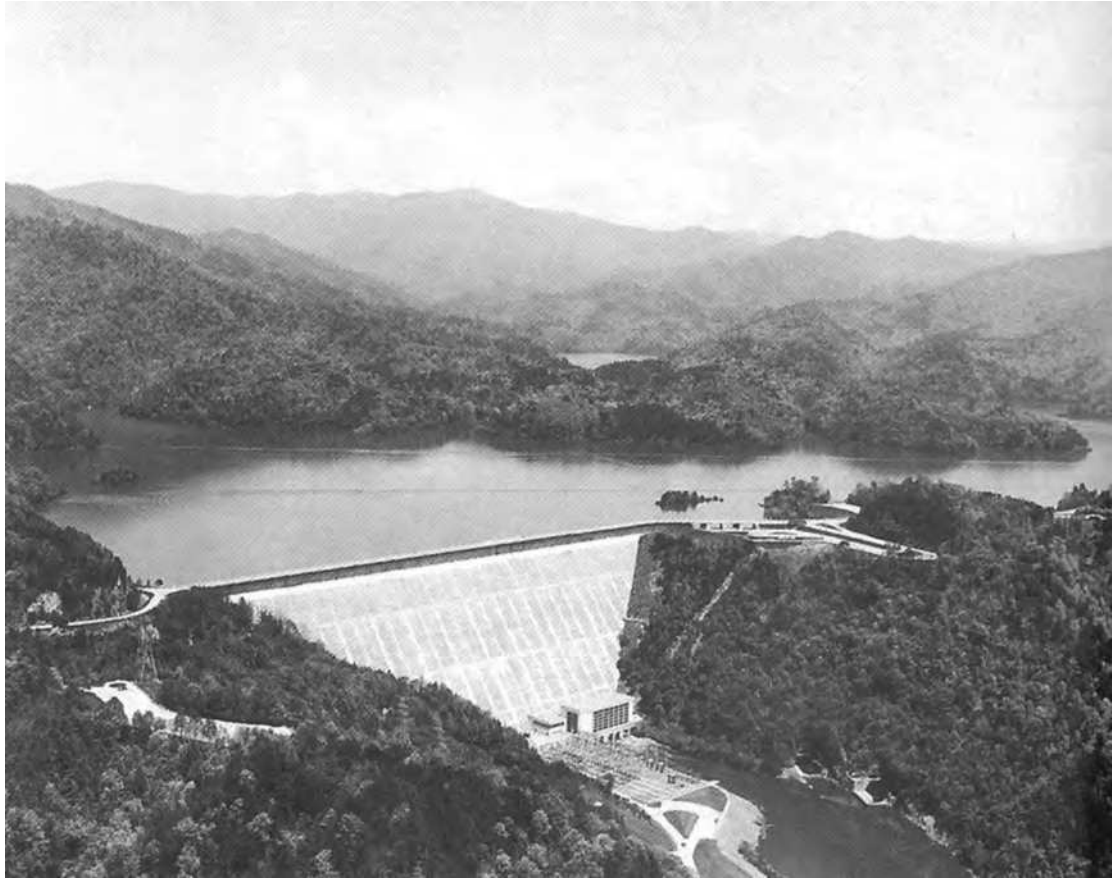
A photograph showing water management in the Tennessee Valley.

14 Look at the photograph, and then answer the questions which follow.