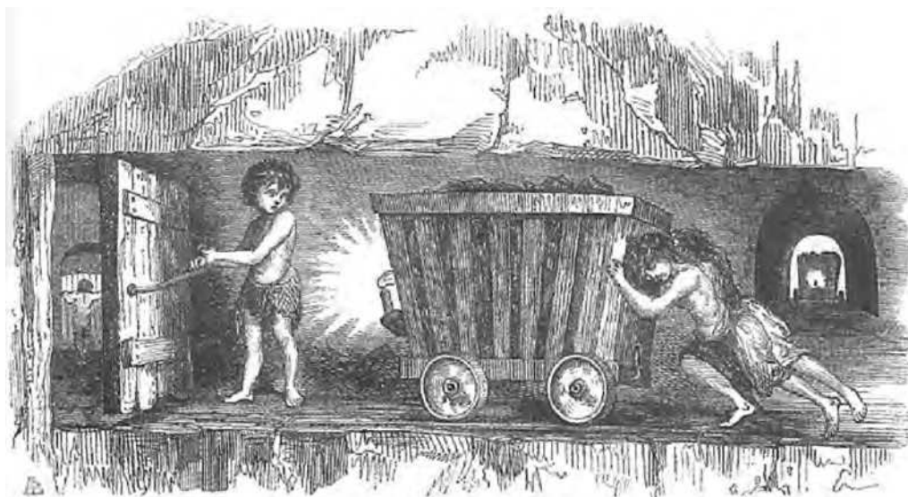
An illustration from the 1842 Report of the Royal Commission on conditions in coal mines.

22 Look at the illustration, and then answer the questions which follow.