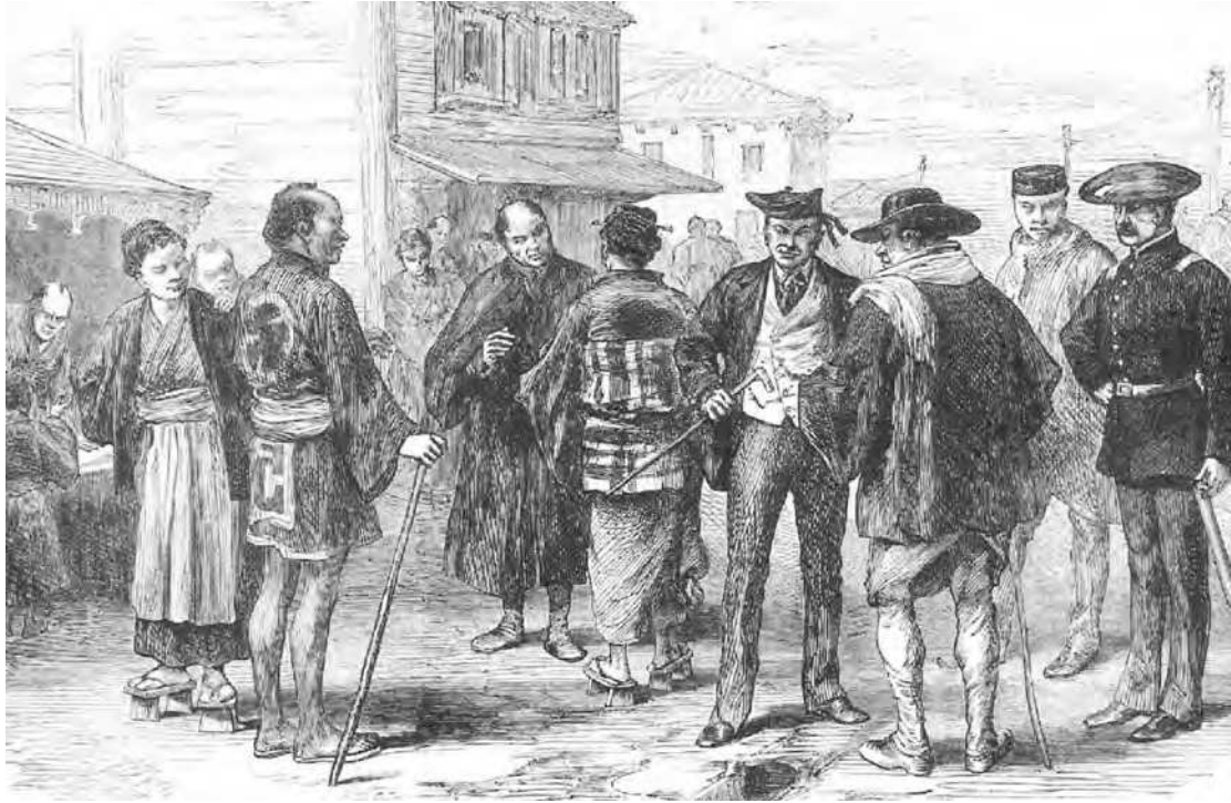
Japanese people wearing traditional and western costumes in 1873.

3 Look at the illustration, and then answer the questions which follow.