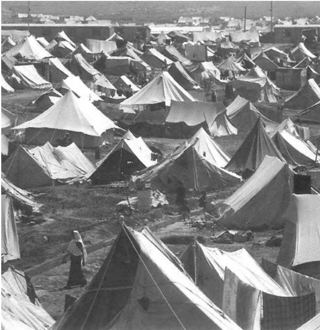
A photograph of a Palestinian refugee camp in Jordan, 1949.

21 Look at the photograph, and then answer the questions which follow.