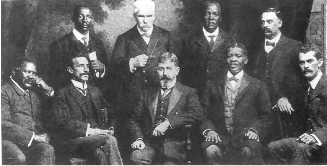
A photograph showing a South African deputation to Britain, 1909. The deputation was seeking full democratic rights for all South Africans.

17 Look at the photograph, and then answer the questions which follow.