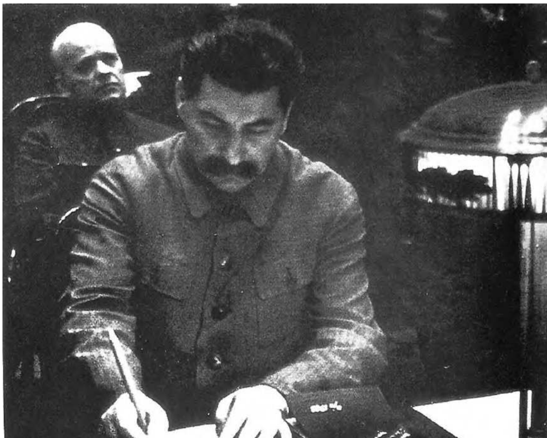
A photograph of Stalin signing death warrants. It was taken in the 1930s.

12 Look at the photograph, and then answer the questions which follow.