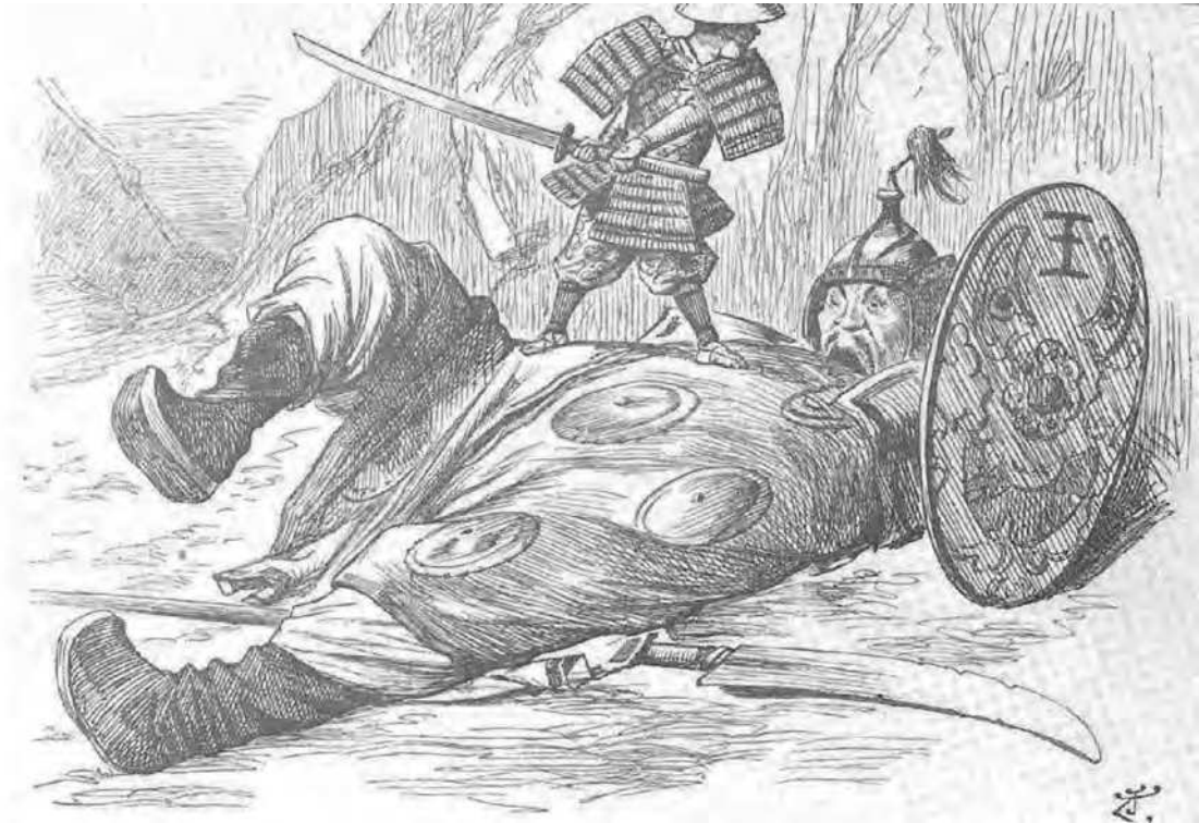
An illustration referring to the Japanese victory over China in 1895.

3 Look at the illustration, and then answer the questions which follow.