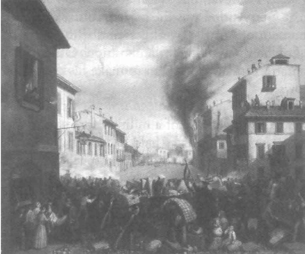
A street battle during the Milan uprising, March 1848.