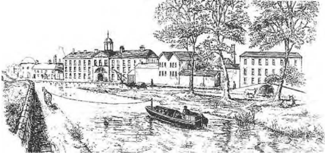
An illustration of Wedgwood's pottery works at Etruria on the banks of the Trent and Mersey Canal, c.1900.

23 Look at the illustration, and then answer the questions which follow.