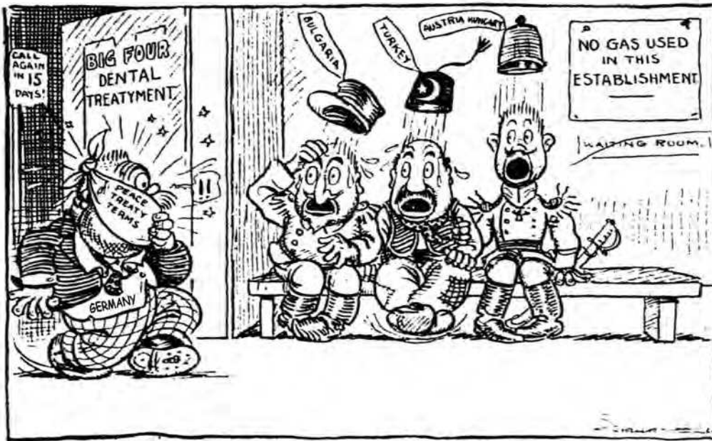
THEIR TURN NEXT.

A cartoon published in an English newspaper in May 1919.