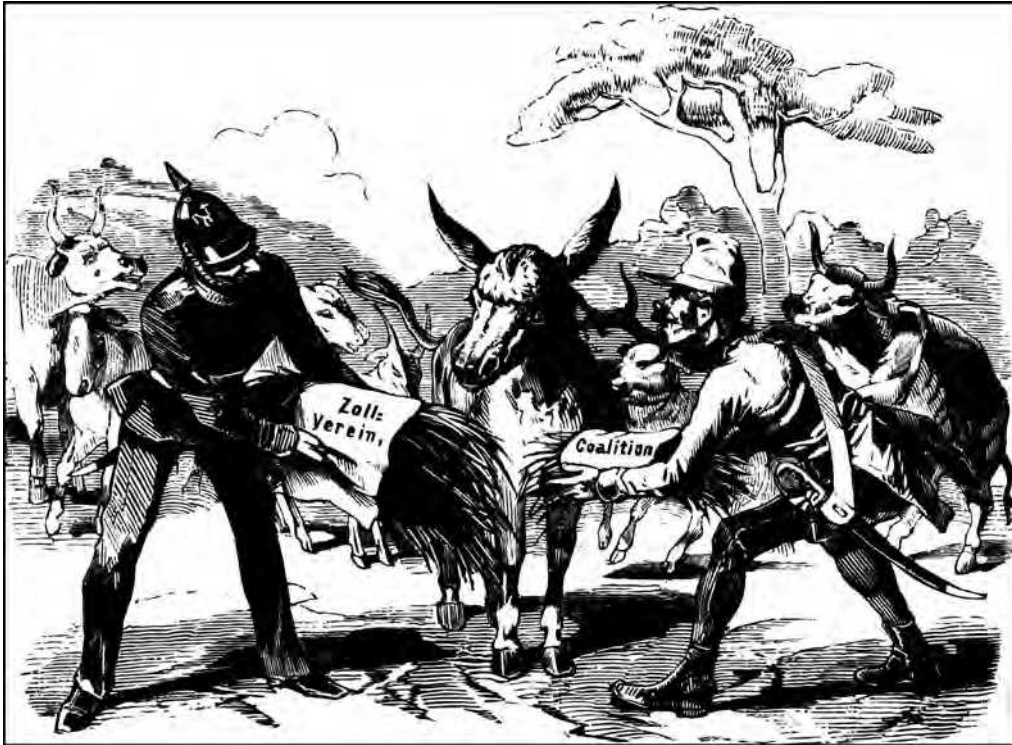
A cartoon from a German magazine published in 1852. The man on the left represents Prussia while the man on the right represents Austria. The animals represent those German states that did not belong to the Zollverein.