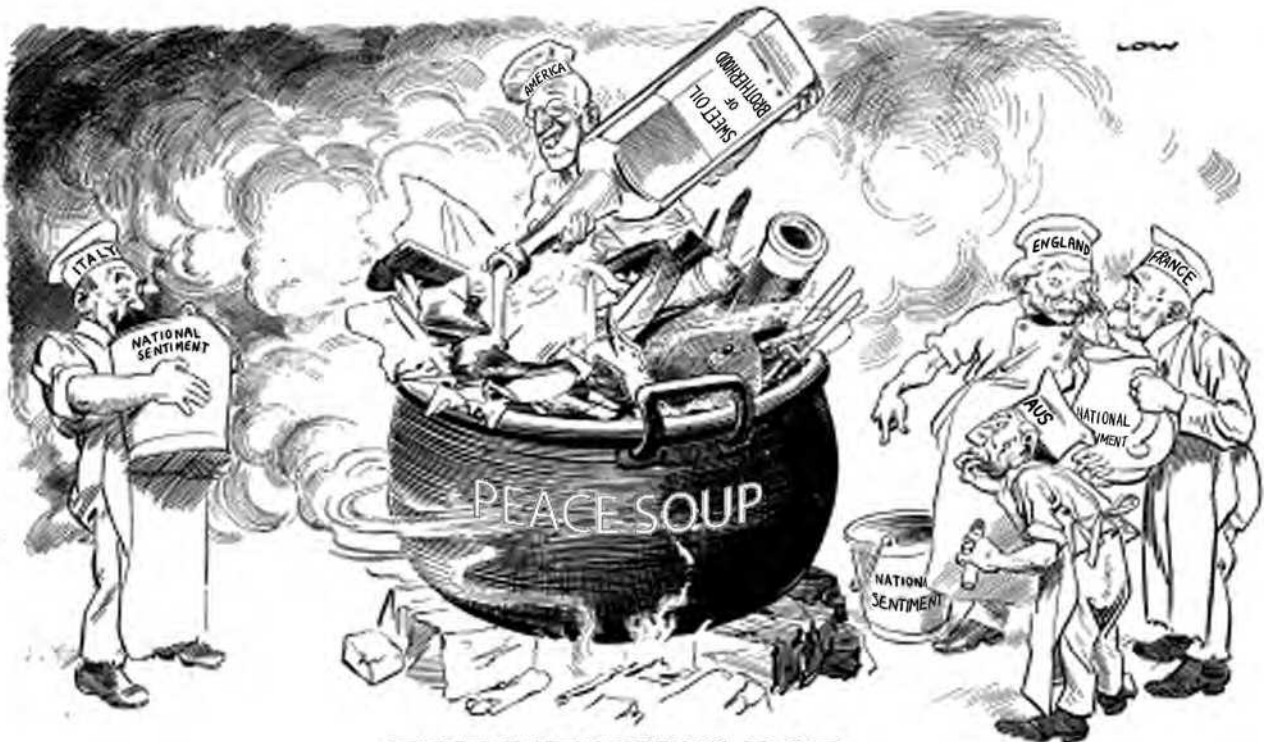
THE MELTING POT.

An Australian cartoon published in 1919.