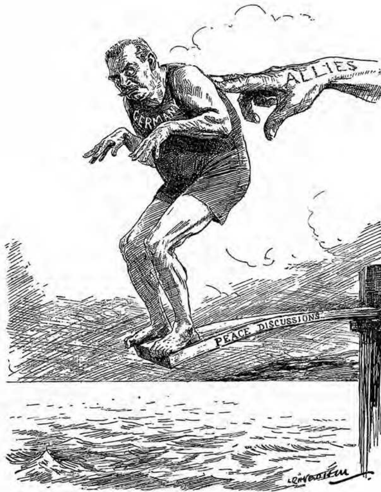
THE FINISHING TOUCH.