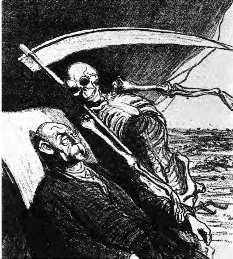
A cartoon from the early 1870s showing Death thanking Bismarck for the thousands killed in the course of unification.