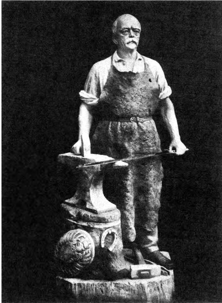
A statue of Bismarck from the 1870s. It shows him making preparations for the unification of Germany.