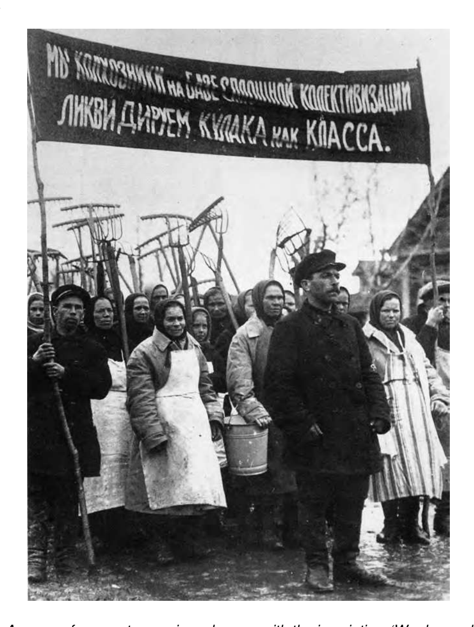
A group of peasants carrying a banner with the inscription, 'We demand collectivisation and the liquidation of the kulaks as a class', 1931.