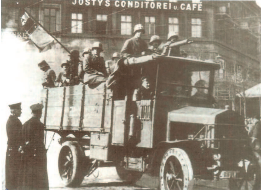
A photograph taken in Berlin in 1920, during the Kapp Putsch.