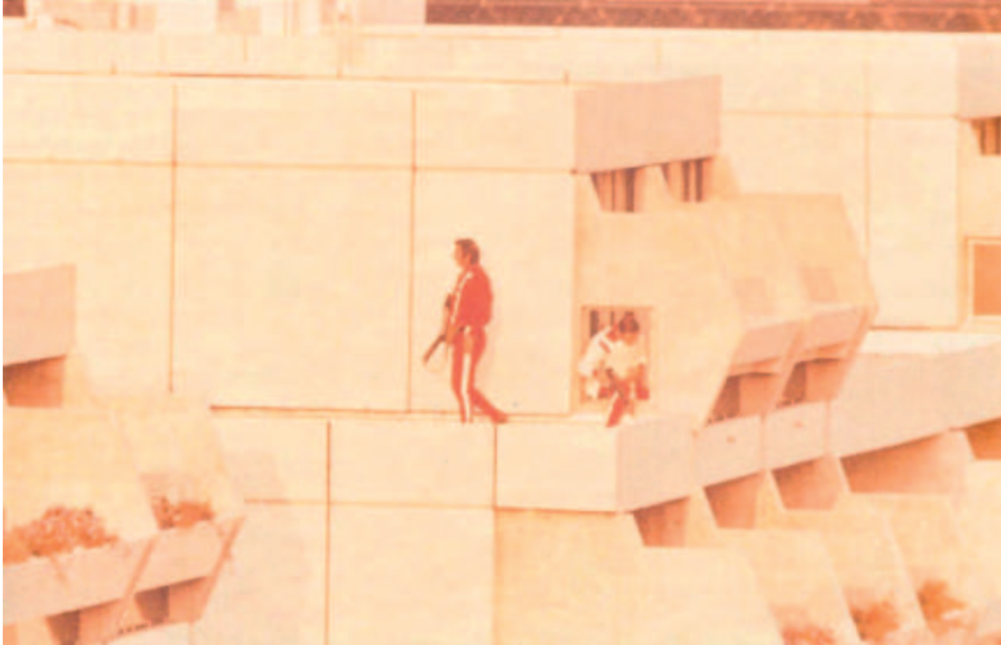
A photograph of an armed German policeman on a building in the Olympic village, Munich 1972.

20 Look at the photograph, and then answer the questions which follow.