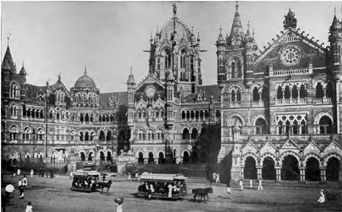
Victoria Railway Station, Bombay.

25 Look at the photograph, and then answer the questions which follow.