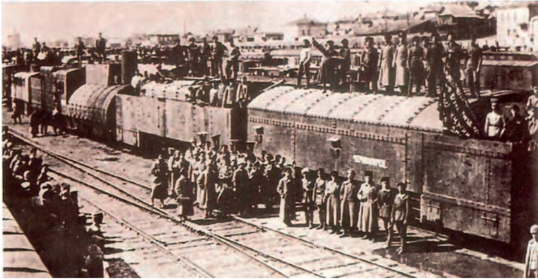
A photograph of an armoured train used by the Bolsheviks during the Civil War.

11 Look at the photograph, and then answer the questions which follow.