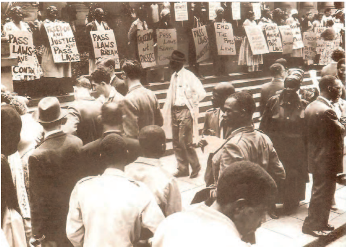
A photograph of women demonstrating against the pass laws in Johannesburg, 1955.

18 Look at the photograph, and then answer the questions which follow.