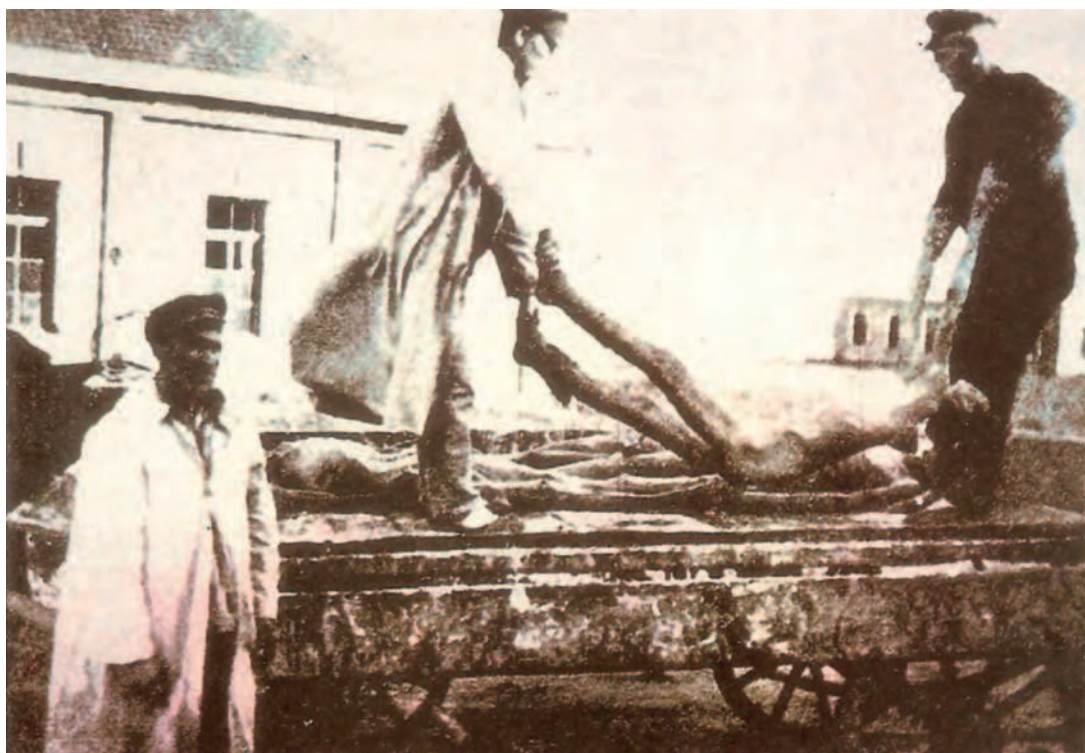
A photograph of the dead being collected during the 1932 famine.

12 Look at the photograph, and then answer the questions which follow.