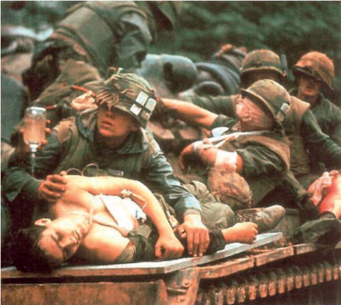
A photograph of wounded US Marines in Saigon during the Tet Offensive, 1968.