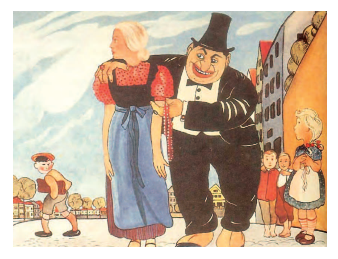
An illustration from a Nazi book for children published in the 1930s.

10 Look at the illustration, and then answer the questions which follow.