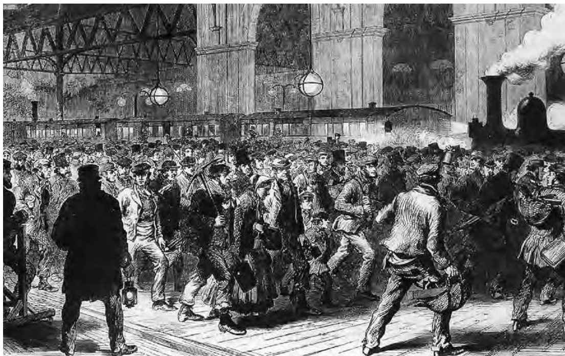
A painting showing the arrival of a working men's train, c.1860.

23 Look at the painting, and then answer the questions which follow.