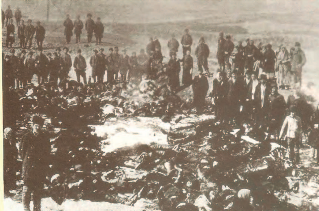
A photograph of striking workers killed by the police at the Lena gold field, 1912.

11 Look at the photograph, and then answer the questions which follow.