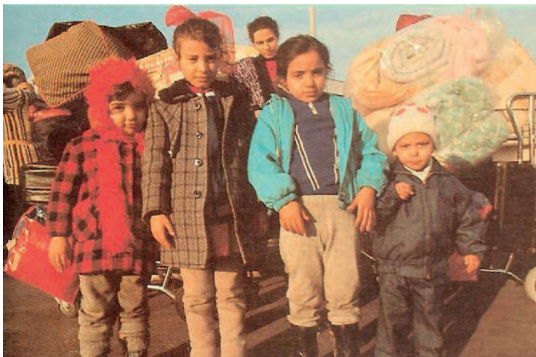
A photograph of Jewish children arriving at Ben-Gurion Airport in Israel in 1990. They have just arrived from the Soviet Union.

21 Look at the photograph, and then answer the questions which follow.