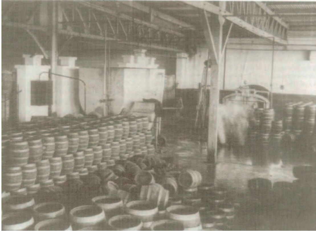
A photograph of an illegal still.

13 Look at the photograph, and then answer the questions which follow.