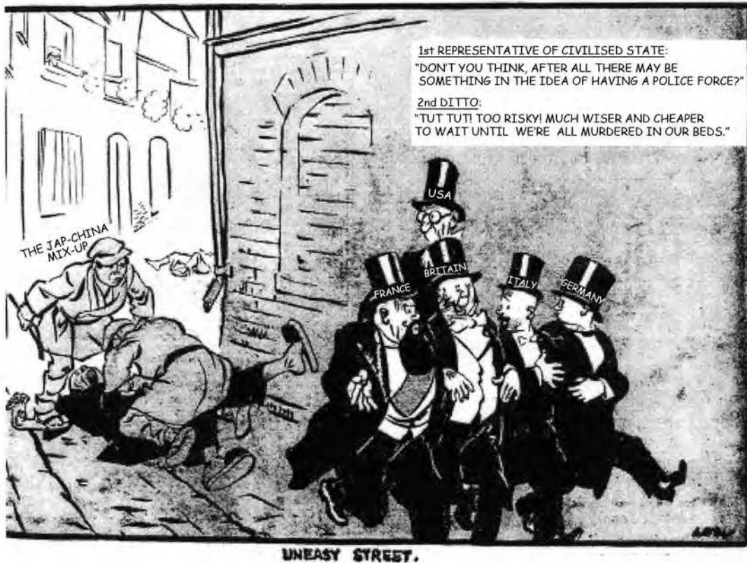
A British cartoon published in January 1933.