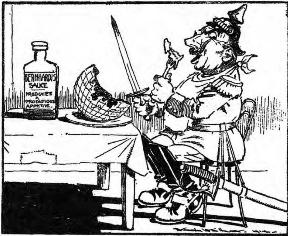
A cartoon published in Britain early in 1914. It is entitled 'The Kaiser's Dream: The End of the World'. Bernhardt was a German general who wrote a best-selling book entitled 'Germany and the Next War'.