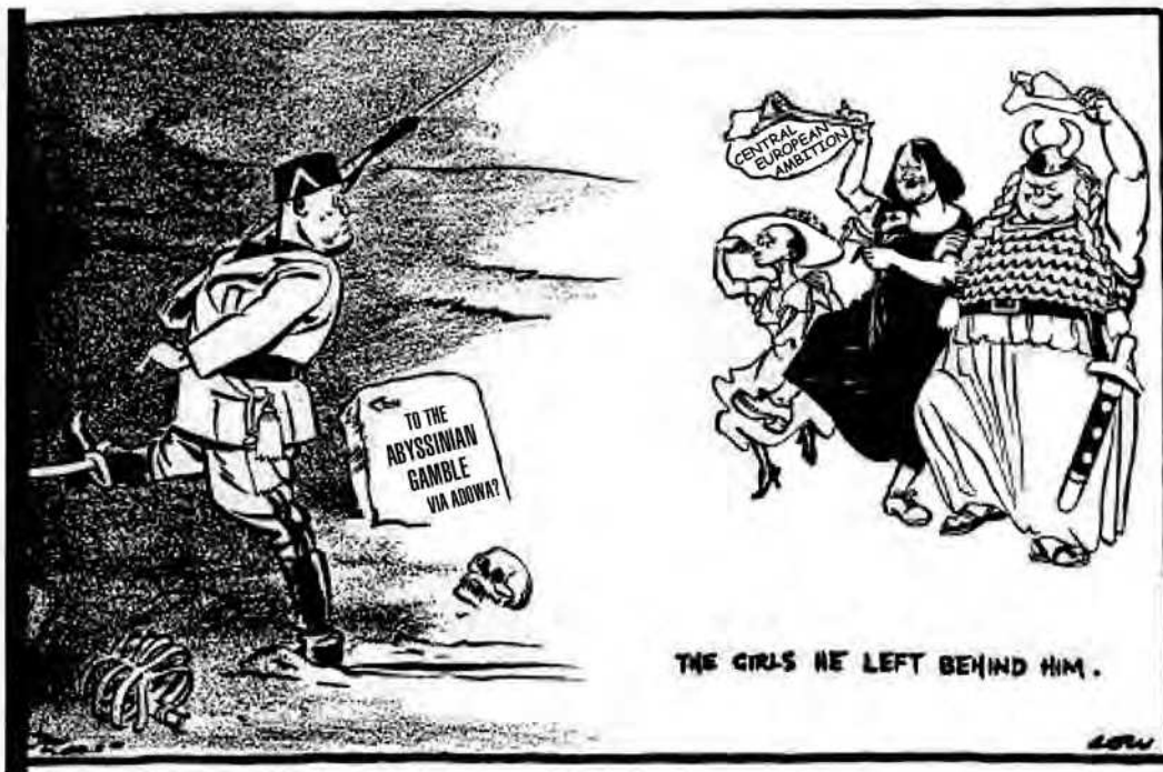
A British cartoon published in May 1935. The three figures on the right are Hitler and two of his leading ministers.