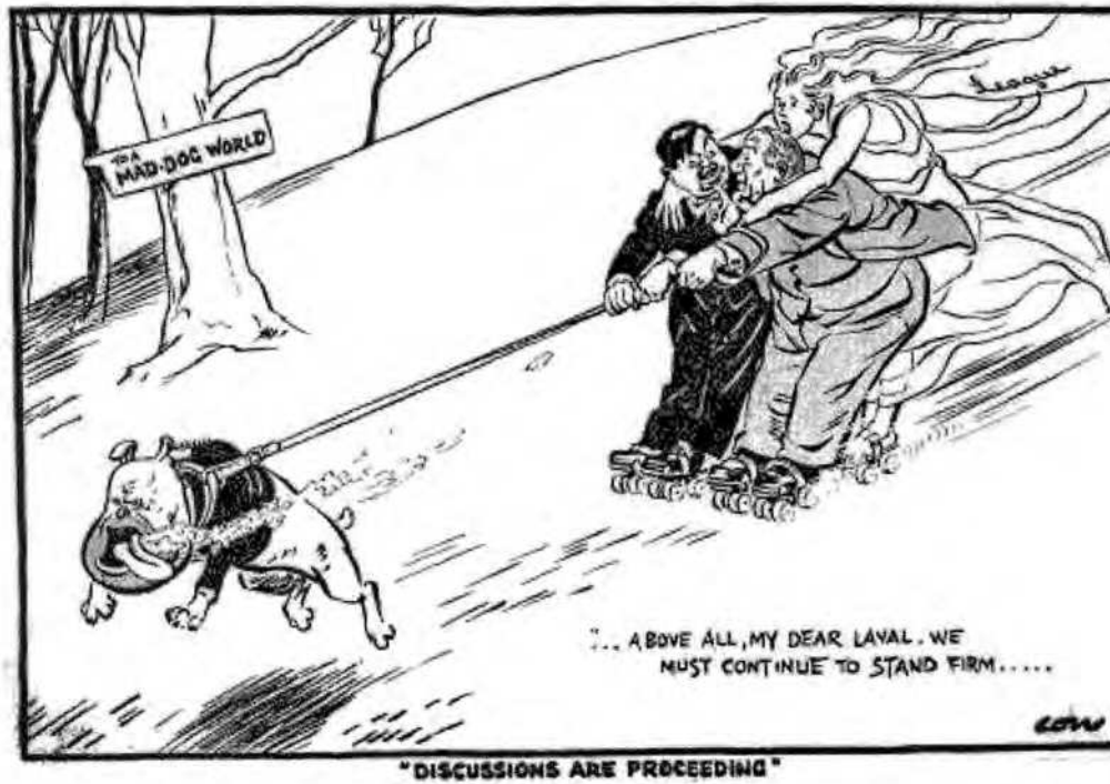
A British cartoon published in August 1935. The two men are Laval and Baldwin (Prime Minister of Britain).