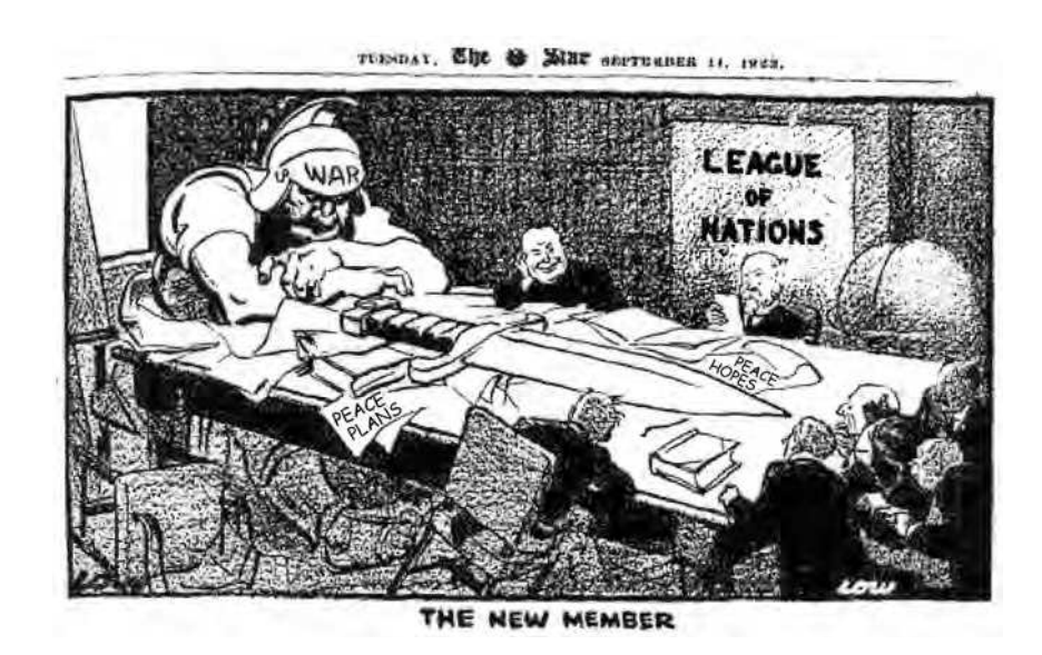
A British cartoon published in September 1923.