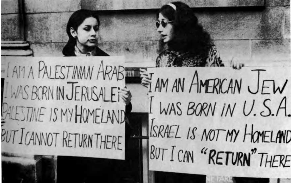
Jews and Arabs demonstrate outside an Israeli Embassy, December 1973.