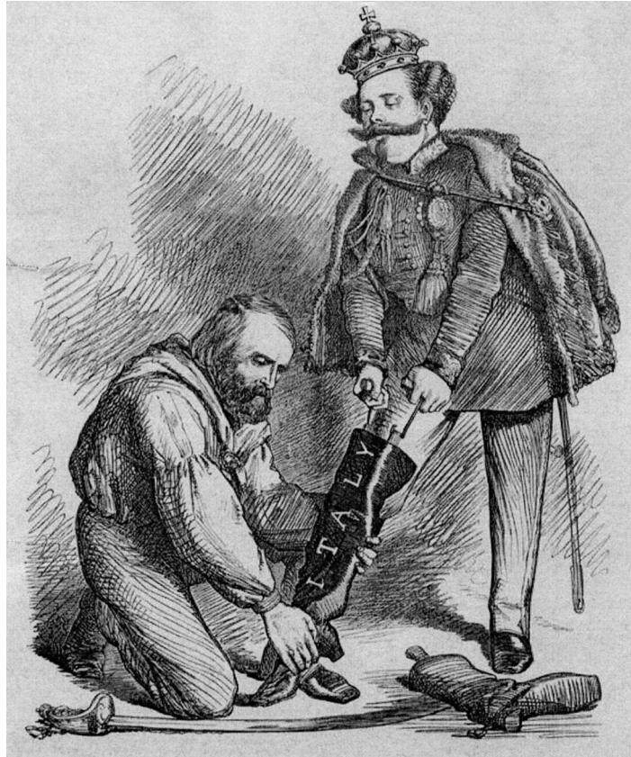
A British cartoon published in November 1860. The title of the cartoon is 'Right Leg in the boot at last'. Garibaldi is saying, 'If it won't go on sire, try a little gunpowder.'