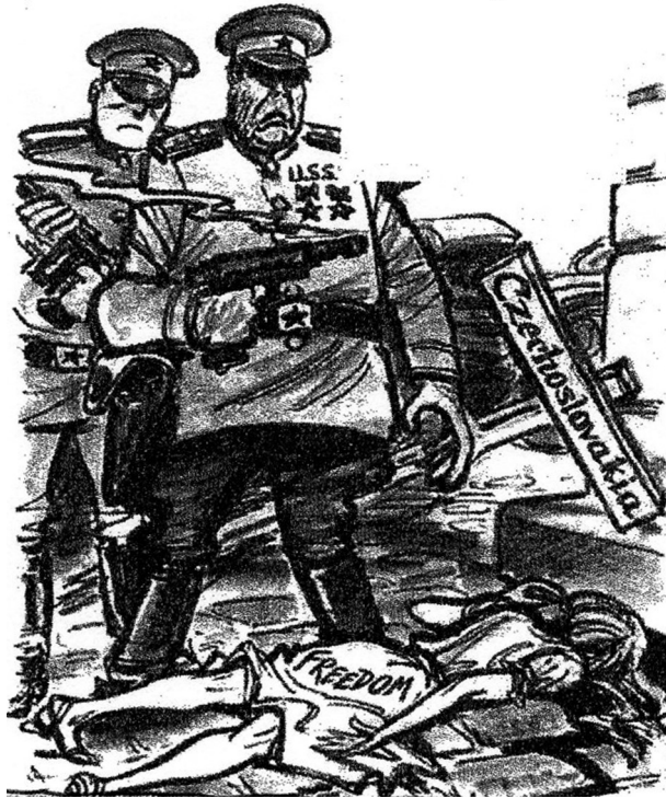
A cartoon published in the USA in September 1968. The soldier is saying 'She might have invaded Russia'.