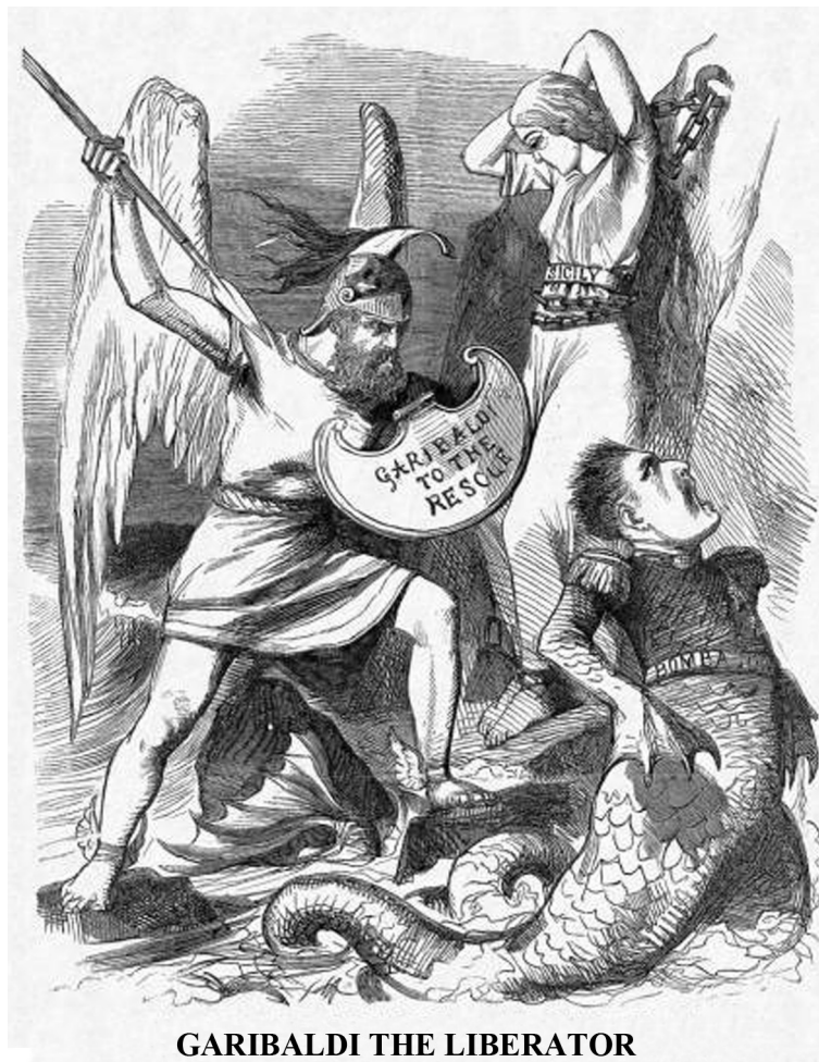
GARIBALDI THE LIBERATOR

A British cartoon published on 16 June 1860. The sea monster represents the Bourbon monarchy.