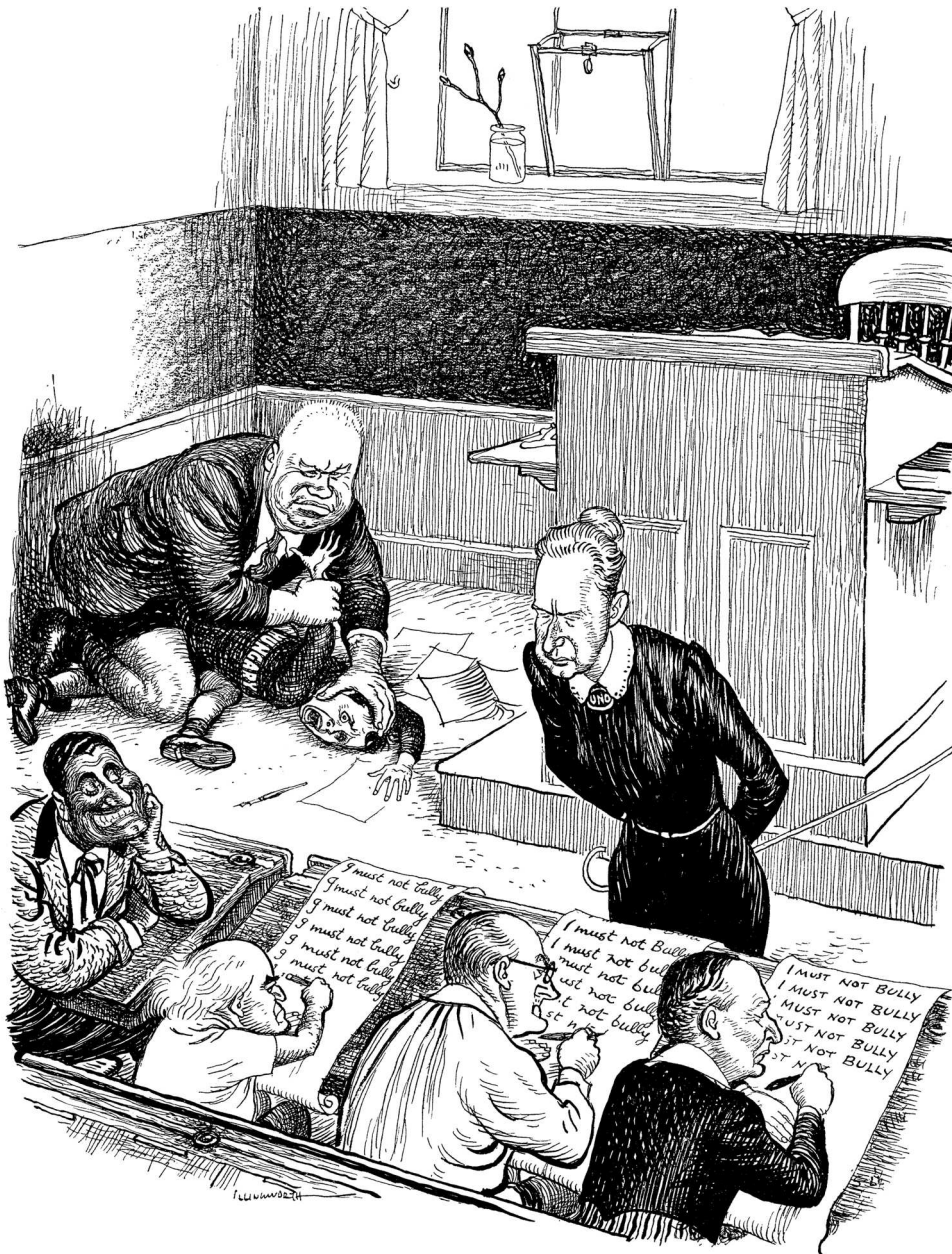
A cartoon from a British magazine published in November 1956, during the Suez Crisis. The figures at the bottom of the cartoon represent President Nasser of Egypt and the governments of Israel, Britain and France.